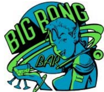
Planet Girl Embroidery only