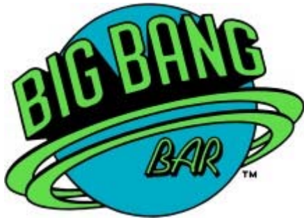
Blue Planet Logo Embroidery & screen-printing