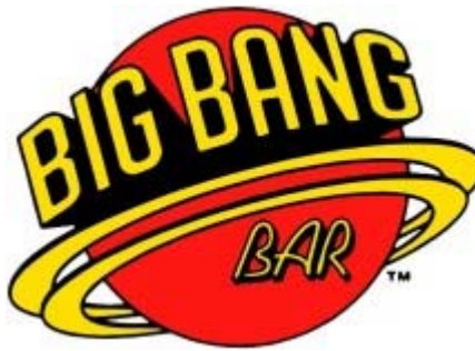
Red Planet Logo Embroidery only